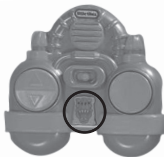
Press the T-Rex button in the middle to see your T-Rex 1) Rotate in a circle or 2) Move from left to right while making chomping sounds. Note:

right while making chomping sounds. Note: 2 Move remote switch to the volume on position to hear sounds (4)).