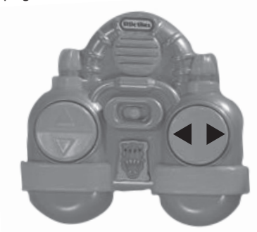
Press the left button and the T-Rex will turn to the left. Press the right button and it will turn to the right. Press and hold the button and your T-Rex will spin in that direction.

right while making chomping sounds. Note: 2 Move remote switch to the volume on position to hear sounds (4)).