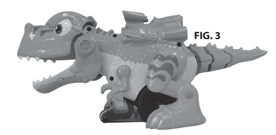
Run into objects and the mouth will close. Press the up button on the remote control to open its mouth again.