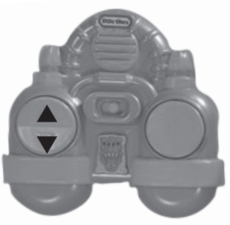
Press the up button to make your T-Rex move forward. (Press the down button and it will go in reverse.)